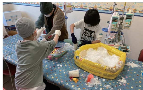
Children playing with snow

Snow Gift is a project in which snow from the camp is packed in boxes and delivered to hospitals and other facilities in areas where there is no snowfall so that children can play in the snow. In some cases, however, smooth delivery of packages to hospitals was not possible. Because of this, our medical representatives, who visit hospitals on a daily basis, supported this project by becoming snow-carrying volunteers. In FY2021, from January to March 2022, our medical representatives delivered snow gifts by hand to the person in charge at six medical institutions, giving children in the hospital who had no opportunity to experience snow the joy of playing in the snow. The children, their guardians, and medical staff who played in the snow later expressed their delight, and employees who participated in the program commented that they were glad to have been able to help "bring the fun (snow)" to the children.