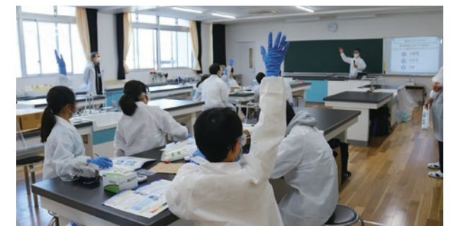
Travelling Classes at Hoshi Elementary School (top) and Shimamoto Town Third Elementary School (bottom)