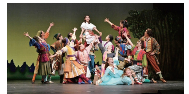
Hajimarinoki no shinwa - Kosoado no mori no monogatari - (The Myth of the Starting Tree - The story of the forest called Kosoado -)

Children are invited to the theater and provided with opportunities to view stage performances in order to encourage them to think about the importance of life and consideration for others. In FY2021 videos were broadcast.