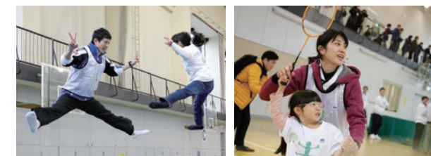
Activities in March 2019

To contribute to reducing childhood obesity, a social issue in areas affected by the Great East Japan Earthquake, we are cooperating with top athletes and medical specialists on lifestyle-related illnesses and carrying out reconstruction assistance. Activities have been cancelled since FY2019 due to the impact of COVID-19.