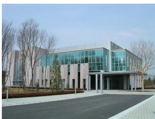
Tsukuba Research Institute (Ibaraki)

This is the first introduction of CN city gas supplied by Tokyo Gas in the pharmaceutical industry.