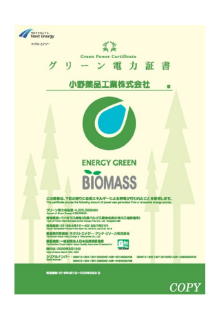
Green power certificate

In addition to introducing solar power generation, purchasing green power certificates and J-credits, we are proceeding with initiatives such as purchasing power from hydroelectric power generation.